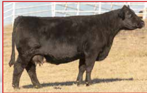
OBCC Sadie 107D, Dam of Lot 42