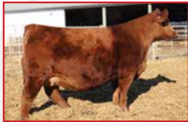
HILB/SHER G749E, Dam of Lot 10