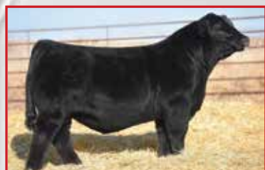
KCCI Exclusive 116E, Sire