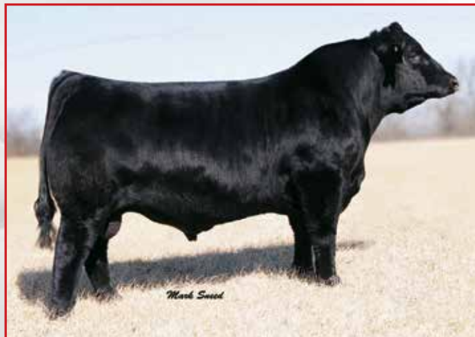
HTP/SVF Duracell T52, Grandsire of Lots 48 & 49

Here is a pair of sons from our herd sire from Hudson Pines 524E, these sons give you an EPD profile with top 20% to 30% for WW and YW meaning these young sires are the type to raise the big calves. With the price of inputs, look for these brothers on sale day to help you raise the big calves with less expense.