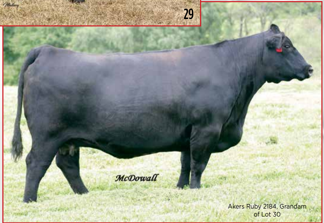
Akers Ruby 2184, Grandam of Lot 30