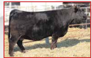
HILB Lost N Love E44G, Dam of Lot 27