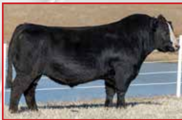
Ruby NFF Up The Ante 9171G, AI Sire of Lot 28