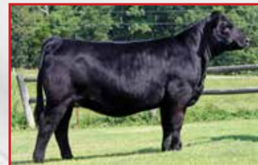
Bramlets Breathe E748, Dam