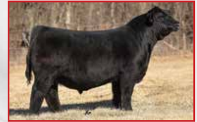
LLSF High Profile J903, AI Sire