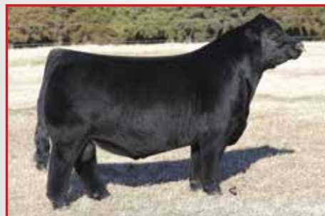
JSUL Something About Mary, Sire of Lot 46

This bull has gotten a lot of attention since the day he was born. A powerful good looking son of Pay the Price backed by a beautiful Relentless mother that is quickly making her way to the top of the cow herd here at Shoal Creek. His mother E1 has sold heifers in each of the last two Gathering Sales and the buyers just loved them for their maternal ability. J124 is a true herd bull that needs to be in a purebred herd producing show heifers and herdsire prospects.