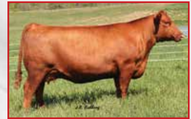
Harmonys Windsong 0269, Great Grandam of Lot 7