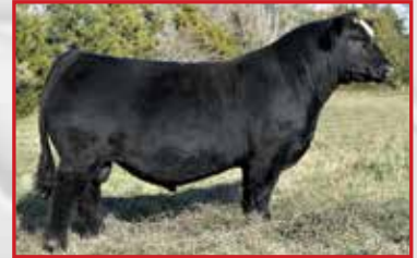
W/C Fort Knox 609F, Sire of Lot 9