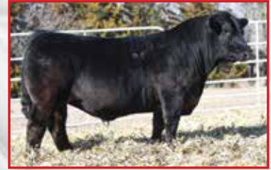
Mr SR 71 Right Now E1538, AI Sire of Lot 25