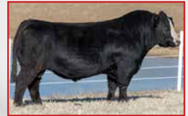
Ruby NFF Up The Ante 9171G, Pasture Sire