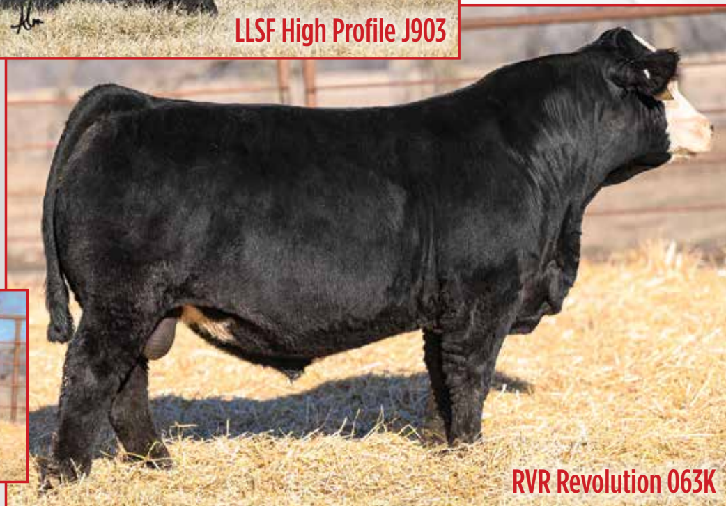
RVR Revolution 063K