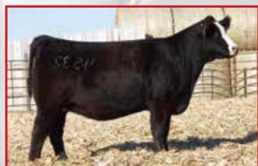
Sandeen Donna 4532, Grandam