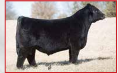
LLSF Vantage Point F398, AI Sire of Lot 27