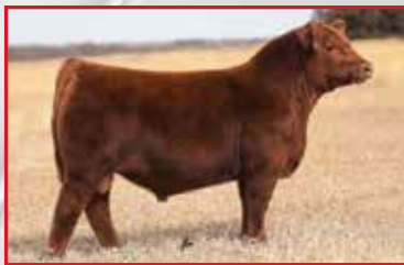
Six Mile Parabellum 675G, Sire of Lot 8