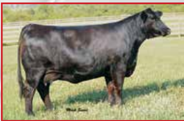
Limestone Lola W232, Dam of Lot 24