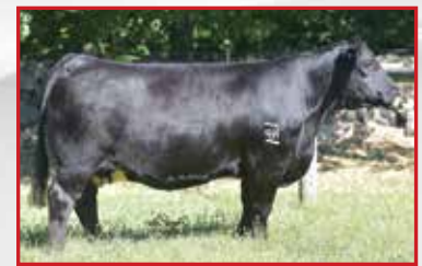
HPF/Borne Knockout Y030, Dam of Lot 31