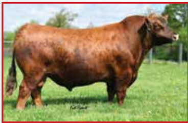
9 Mile Franchise 6305, Sire