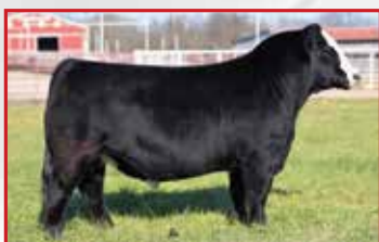
HILB Oracle C033R, Sire of Lot 44