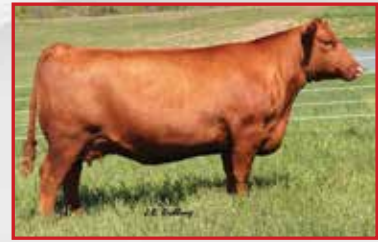
Harmonys Windsong 0269, Dam