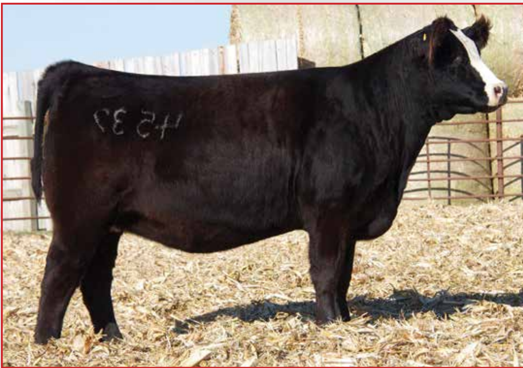
Sandeen Donna 4532, Dam of Lot 23