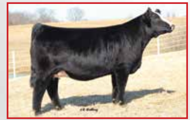
SC Robins Kiss D27, Dam