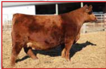
HILB/SHER G749E, Dam