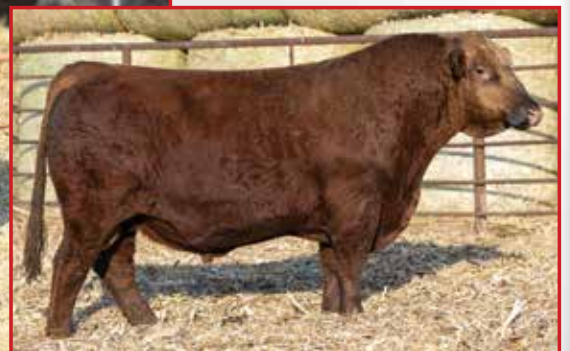
KBHR Sriracha H127, Embryo Sire