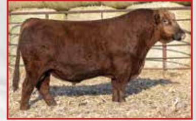
KBHR Sriracha H127, AI Sire of Lot 29