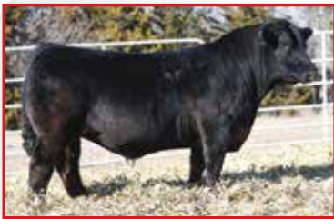
Mr SR 71 Right Now E1538, AI Sire of Lot 18