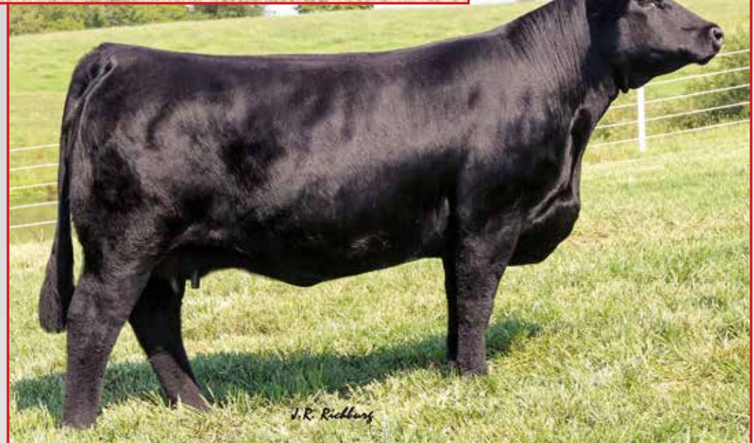
SC Daisy Duke C1, Dam of Lot 32