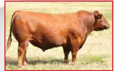
Lacy Collusion 115F, Sire of Lot 7