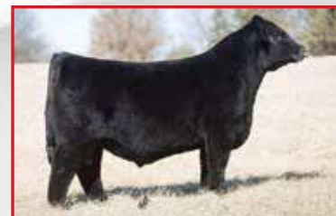
LLSF Vantage Point F398, Sire