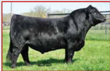
HPF Quantum Leap Z952, Sire