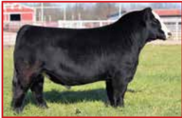
HILB Oracle C033R, Sire of Lot 30