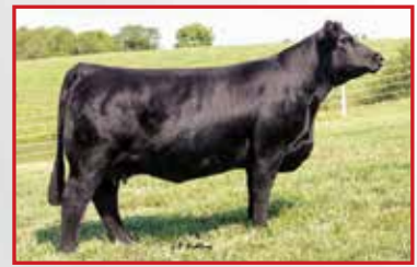
SC Daisy Duke C1, Grandam of Lot 25 & Dam of Lot 26