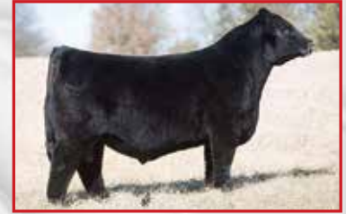
LLSF Vantage Point F398, AI Sire of Lot 17