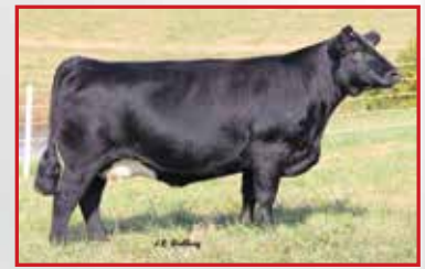
LLSF Robins Kiss YS51, Grandam of Ot 17