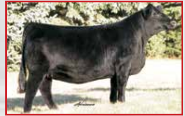
HS Sweet Gem X141N, Dam