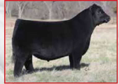
Gateway Follow Me F163, Sire