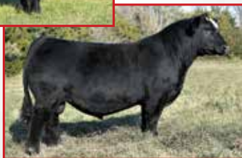
W/C Fort Knox, Sire of Lot 43