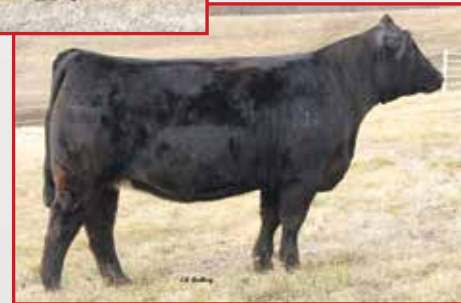
SC Shasha G132, Dam of Lot 47