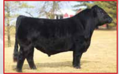
CDI Innovator 325D, Sire