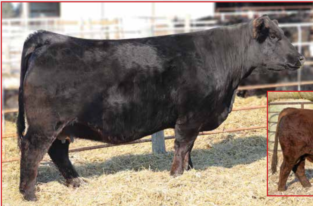
HILB Lost N Love E44G, Embryo Dam

Guaranteeing one 60 pregnancy if work is performed by a certified embryologist.