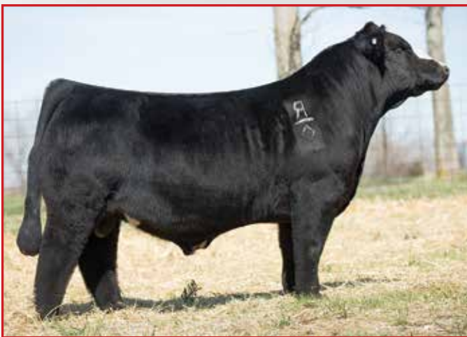
Up The Ante as a yearling

A once in a lifetime opportunity to purchase a herd sire Up the Ante 9171G, this sire has done more for Shoal Creek than any other. With the amount of females he has left us, it was time for us to part with this incredible bull. Take a look at this mature sire and you will see the long spine, depth of body, and bone he possesses, he will translate that to his progeny. He has 105 registered progeny with the ASA and many more to come.