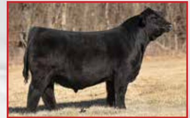
LLSF High Profile J903, AI Sire