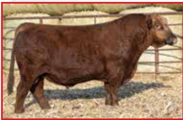
KBHR Sriracha H127, AI Sire of Lot 26